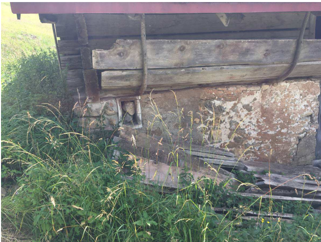
Old wall