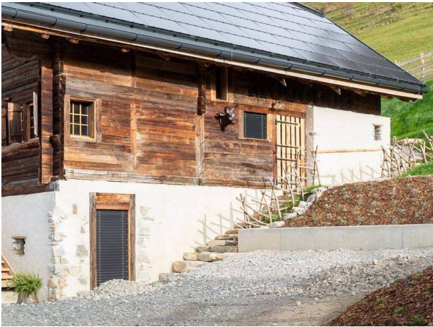
New wall © Daniel Baggenstos

Is there any related publication? If yes, please provide any available link or document for further reading