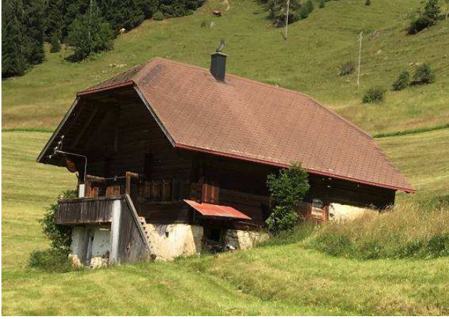
Before renovation

https://www.hiberatlas.com/smarteredit/projects/220/g-19-10-02_solarpreispub19_fueradag_v2.p081_1.pdf Schweizer Solarpreis 2019 (German)